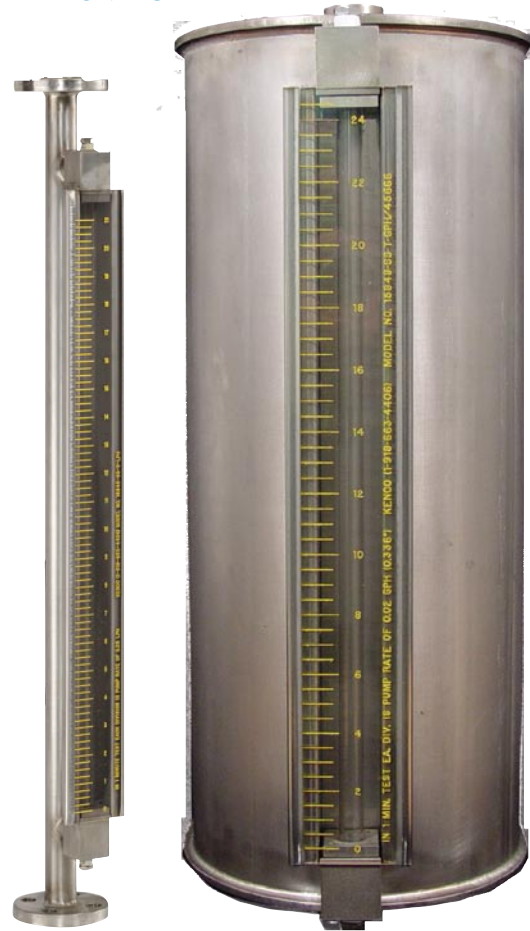
CALIBRATION POTS AVAILABLE WITH FLANGED OR THREADED CONNECTIONS